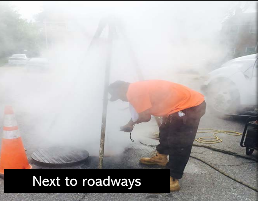
Next to roadways