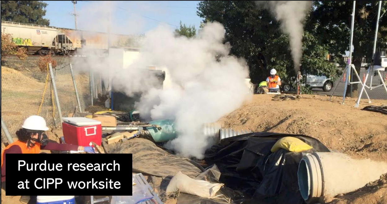
Purdue research at CIPP worksite